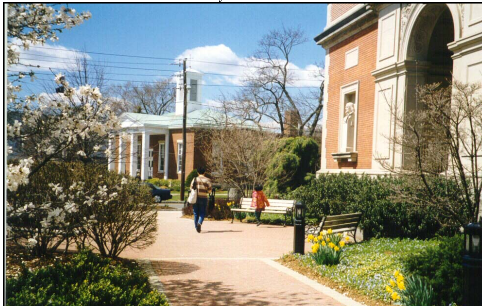
Library and Post Office