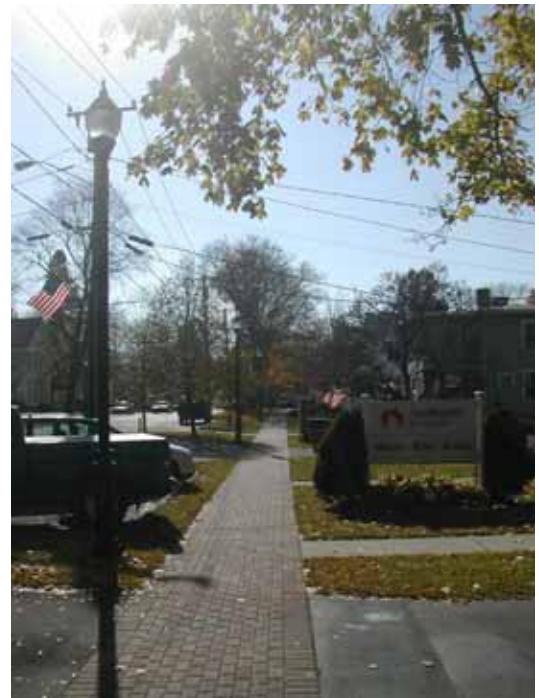
Brick sidewalk paving creates a continuous path through a driveway curb cut.