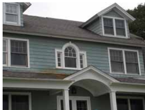
A Palladian window can be used as a distinctive façade element