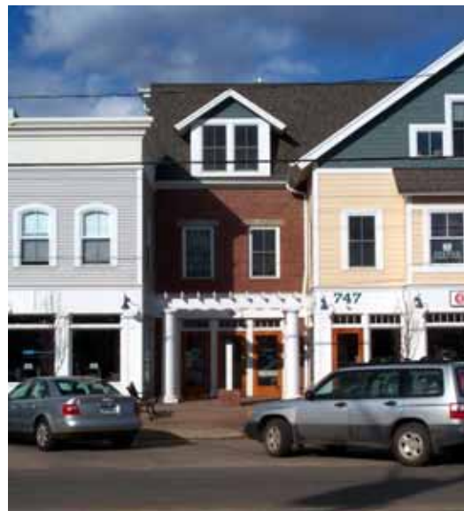
A combination of the preferred window styles can create interesting storefront compositions.