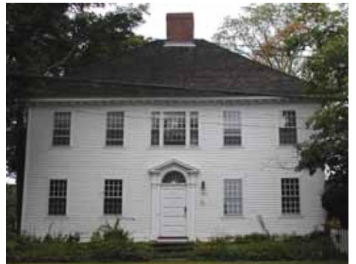
A hipped roof occurs when the roof plane slopes in all directions.