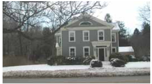
The gable is a simple and timeless building profile.