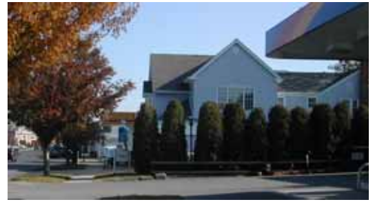
Evergreens provide a buffer on the edge of the Sunoco parking lot.