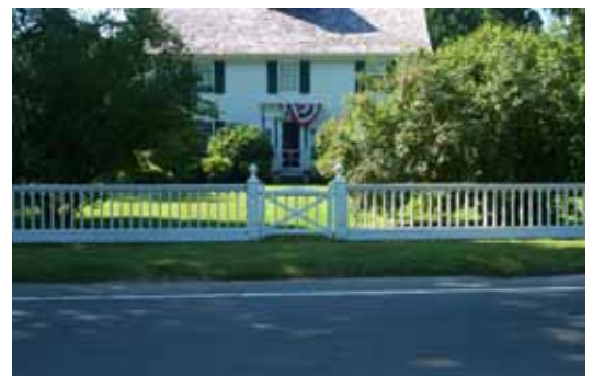
Residential fencing on Post Road West