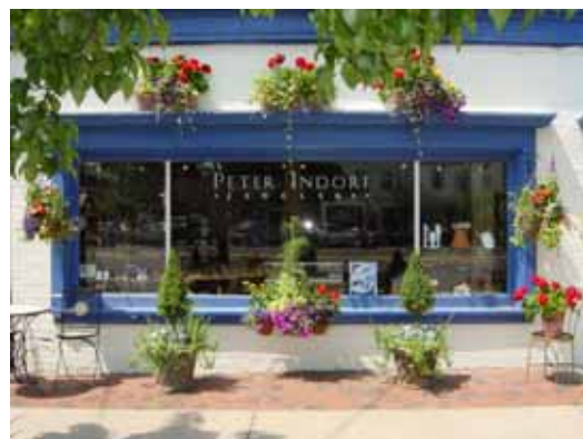
Storefronts can successfully integrate wide windows