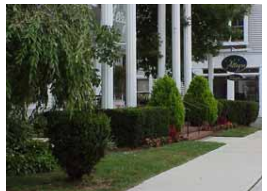
Commercial buildings with yards should be appropriately landscaped.