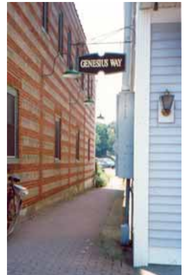
Small perpendicular signage is acceptable.