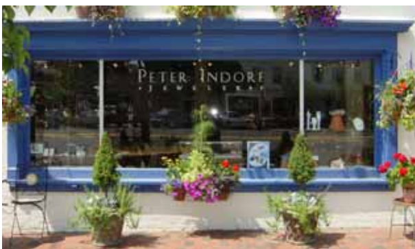
The signage in this window is of an appropriate size.