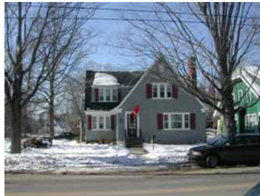
Complex roof type: main roof is a gable, with a cross-gable at a perpendicular angle.