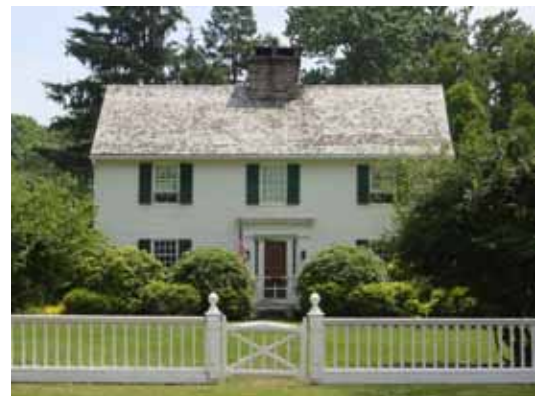
On residential buildings, an architectural feature often highlights the front door.