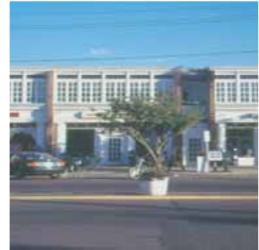
Street trees that block signage should be avoided.