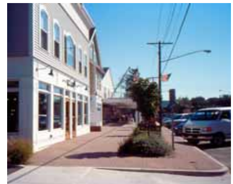
Desirable street tree placement

The Commission may require additional landscaping or more mature plantings when unusual conditions require more extensive screening, or for noise abatement to prevent the depreciation of adjoining residential properties.