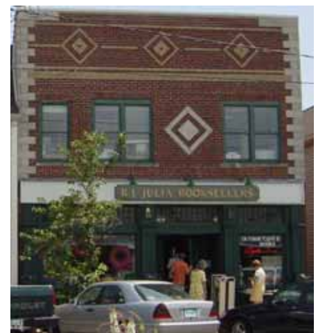
Signage is most commonly appropriate between the first and second levels of the building.