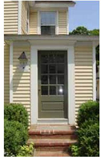
This door has an appropriate frame and real muntins.