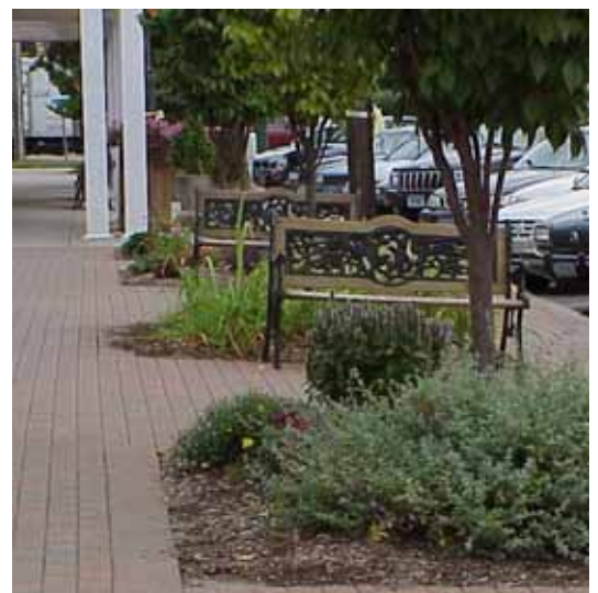
Tree wells are also good opportunities for landscaping.