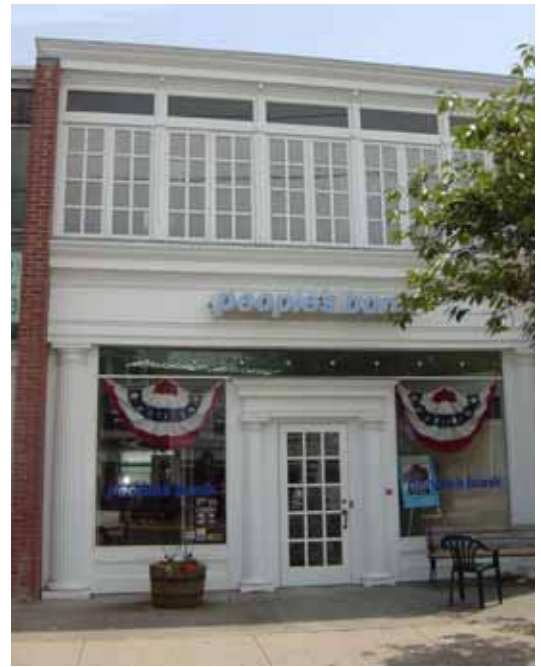
This storefront successfully uses different window types for street level and the second level.