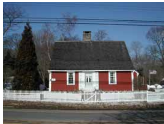
Simple roof type: single gable with no secondary roofs.