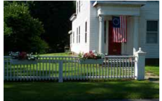
This Post Road residence incorporates appropriate landscaping elements.