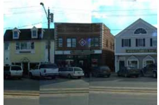
Party wall buildings