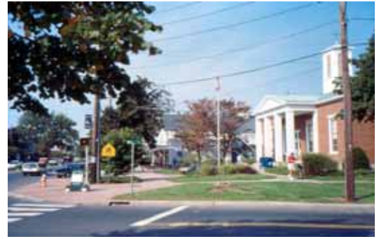
Post office corner