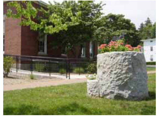
The town's historic horse trough functions as a planter.

Views to these areas and public access should be protected and enhanced wherever possible. The landscaping of abutting properties should contribute to the visual enhancement and public enjoyment of these areas.