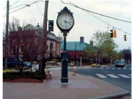
View of library from post office corner