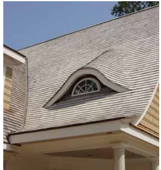
“Eyebrow” windows enliven the roof of this house.