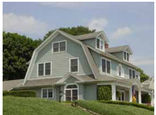
A gambrel roof or "barn" roof.