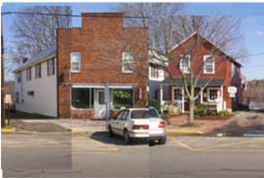
False fronts may be appropriate in the densest commercial area of Madison.