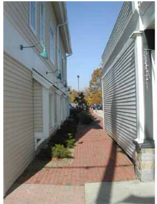
This preferable pedestrian alley has landscaping elements and is properly lit.