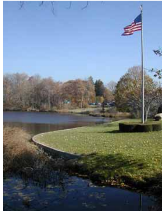
Back yards behind the north side of the Post Road line Tuxis Pond.