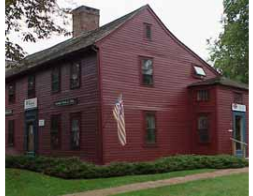
Wood siding is encouraged.