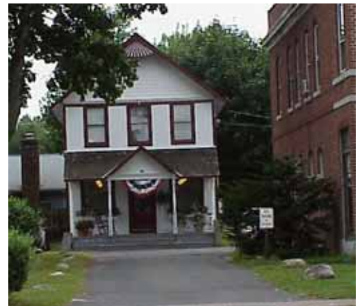
Accessory building on Wall Street